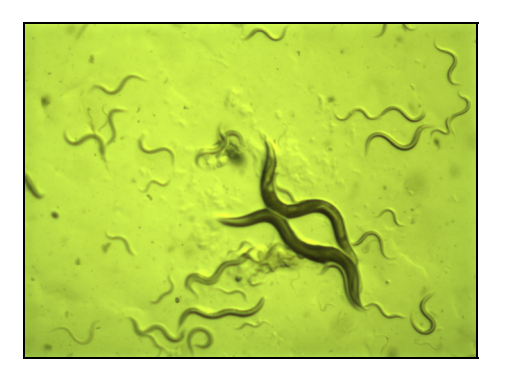
Figure 2. (P1) Normal adult worms were significantly larger than the small worms.