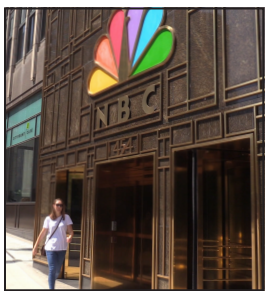
Julie Lord '21 worked as a marketing and promotions intern at Cumulus Media in the NBC Tower in Chicago.

At Lake Forest all students are required to complete an experiential learning opportunity, such as an internship, summer fellowship, or senior thesis. This allows our students to apply their liberal arts skills through a substantive experience outside the classroom, and to see how those skills are valued by employers.