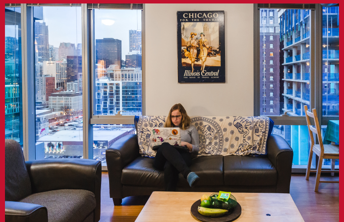
Lake Forest College In The Loop is the College's off-campus program in Chicago. Students spend a semester in the city living, taking classes, and completing a credit-bearing internship of 20 hours per week working in a professional environment.

Our ideal location just 30 miles north of one of the greatest cities in the world—Chicago—provides unparalleled access to top internships and career opportunities. Chicago is home to over 400 major corporate headquarters (including 36 in the Fortune 500), countless museums, theaters, consulates, and more. No matter what your interest or major, you will find an opportunity to explore a career path.